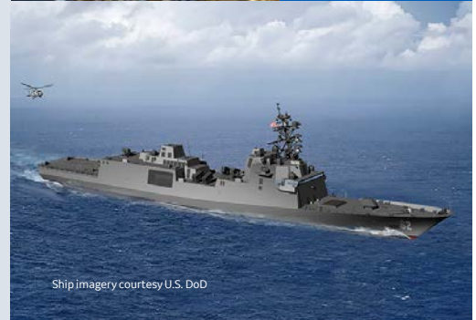
Ship imagery courtesy U.S. DoD